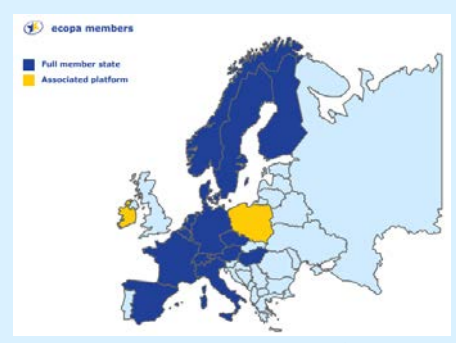
Norecopa is a member of ecopa