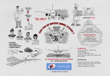
3-minute film about PREPARE: norecopa.no/PREPARE/film

The PREPARE Guidelines consist of a 2-page checklist, in 20 languages, and a website with guidance on each of the 15 topics on the checklist. PREPARE, used from day 1 of planning, will help identify possibilities for Replacement, Reduction and Refinement of animal research.