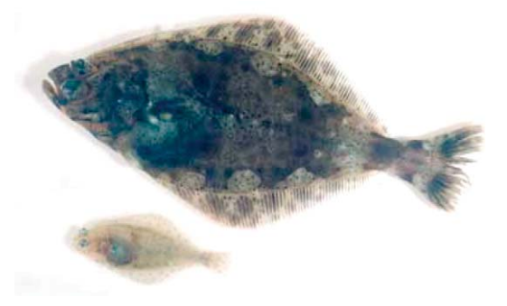
Figure 3 Atlantic halibut Hippoglossus hippoglossus from a commercial fish farm in Norway. This photograph illustrates that fish of the same age (12 months) may be of totally different sizes (2 and 40 g)

Heritability of disease resistance in fish has been shown for bacteria (Gjedrem & Gjøen 1995), viruses (Okamoto et al. 1993), fungi (Nilsson 1992) and parasites (Kolstad et al. 2005). Breeding programmes in, for example, Atlantic salmon have led to increased disease resistance in each generation. Challenge models established in one generation of fish may therefore not provide the same results in the next generation (Johansen L-H, personal communication). Resistance to different agents may be independent of each other or may be positively or negatively correlated.